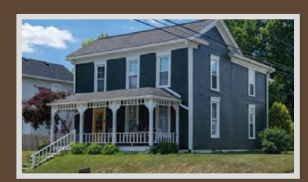
1049 SOUTH 9TH ST.