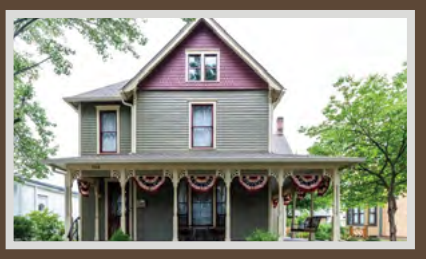
III8 CHERRY ST.